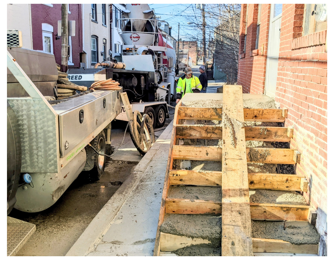
Pumping concrete for front steps on Grant Street and ramp access from parking lot.