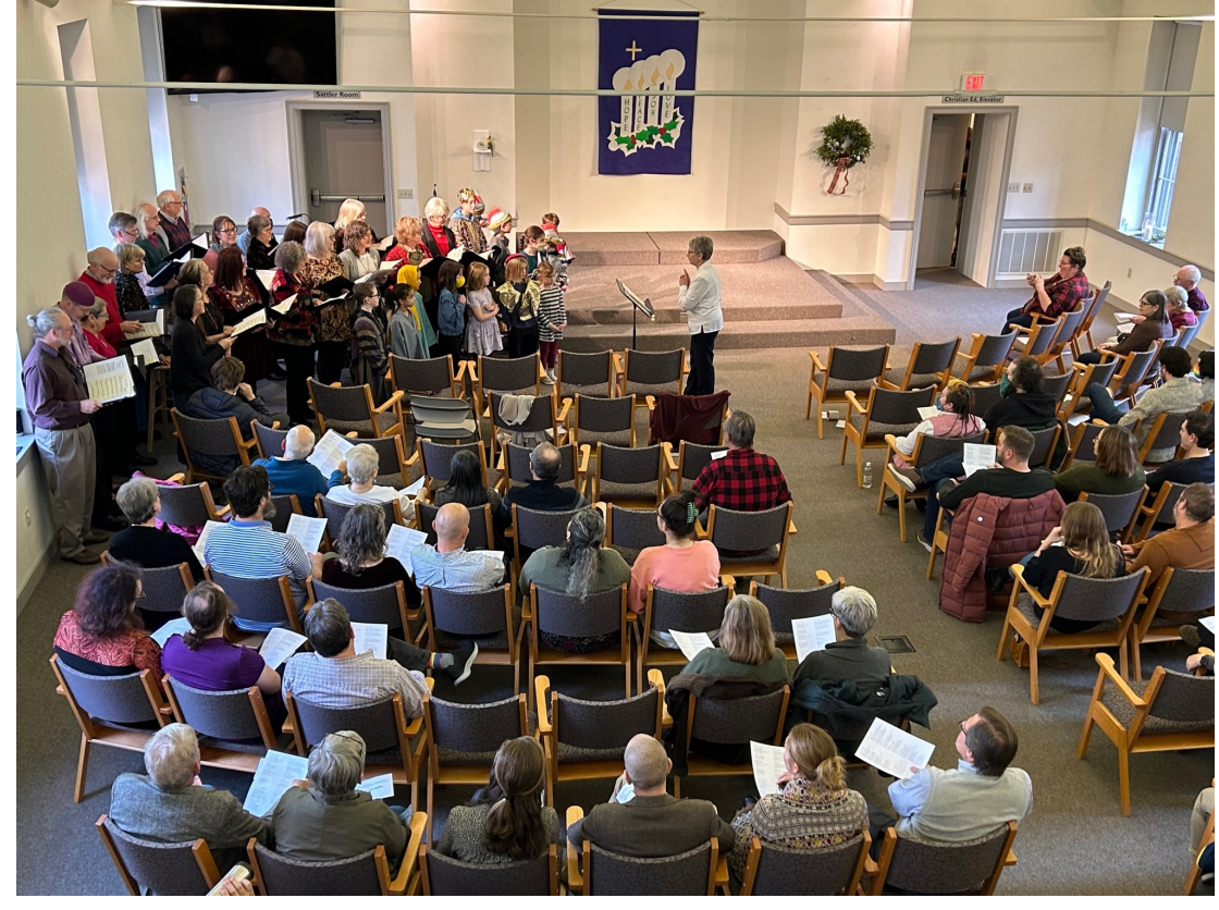
December 18 Christmas Program

OFFICE HOURS— The church office will be closed on Monday, December 26th and Monday, January 2nd.