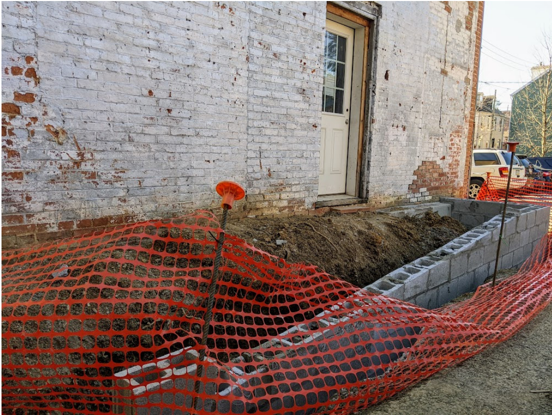
Forming new steps at front entrance from Grant Street and ramp access from parking lot.